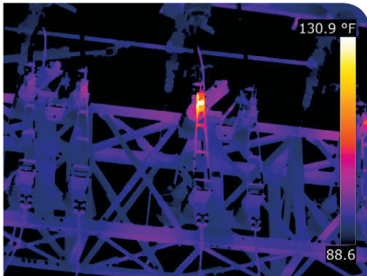
Overheating substation circuit breaker